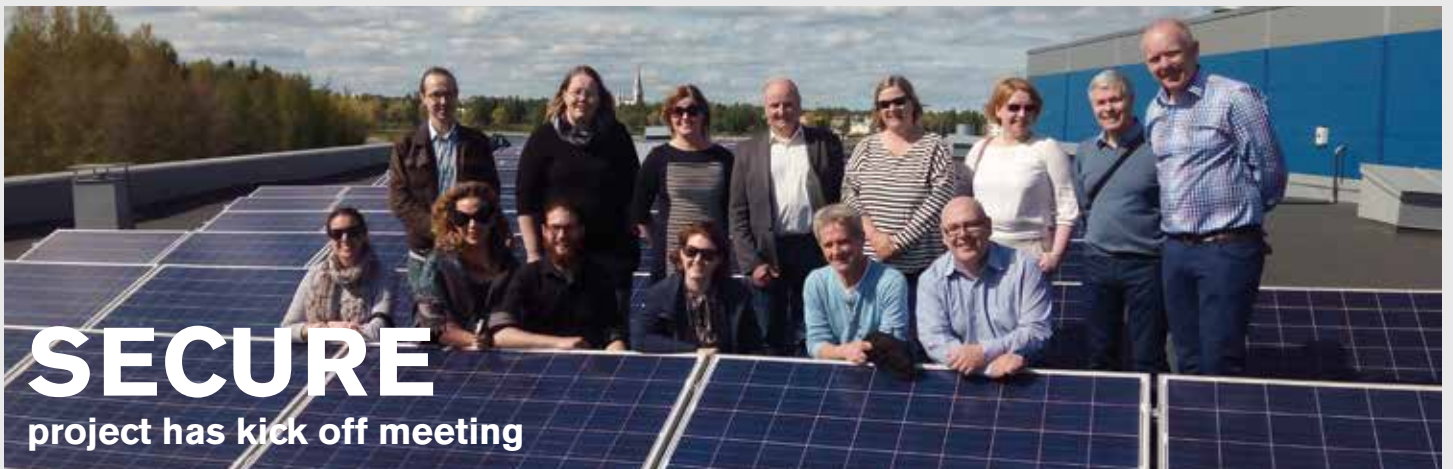
Project partners at the steering group and partner meetings in Joensuu, Finland May 2016

SECURE (Smarter Energy Communities in Northern & Arctic Regions) is a €1.8 million euro project part-funded by the Northern Periphery and Arctic Programme.