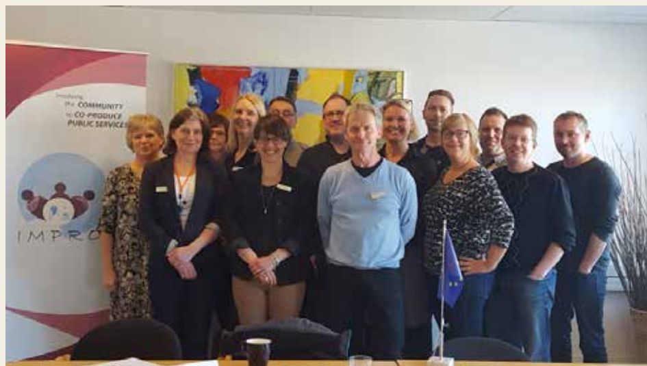
Vasternorrland (Sweden) partners and local champions 2016