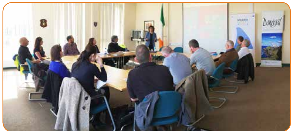
Participants in the WILDSEA Europe information session in Carndonagh 2016

Co-funded by the COSME programme of the European Union