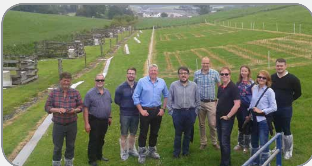
WaterPro Partners visit AFBI SRC Willow Pilot Site at Hillsborough