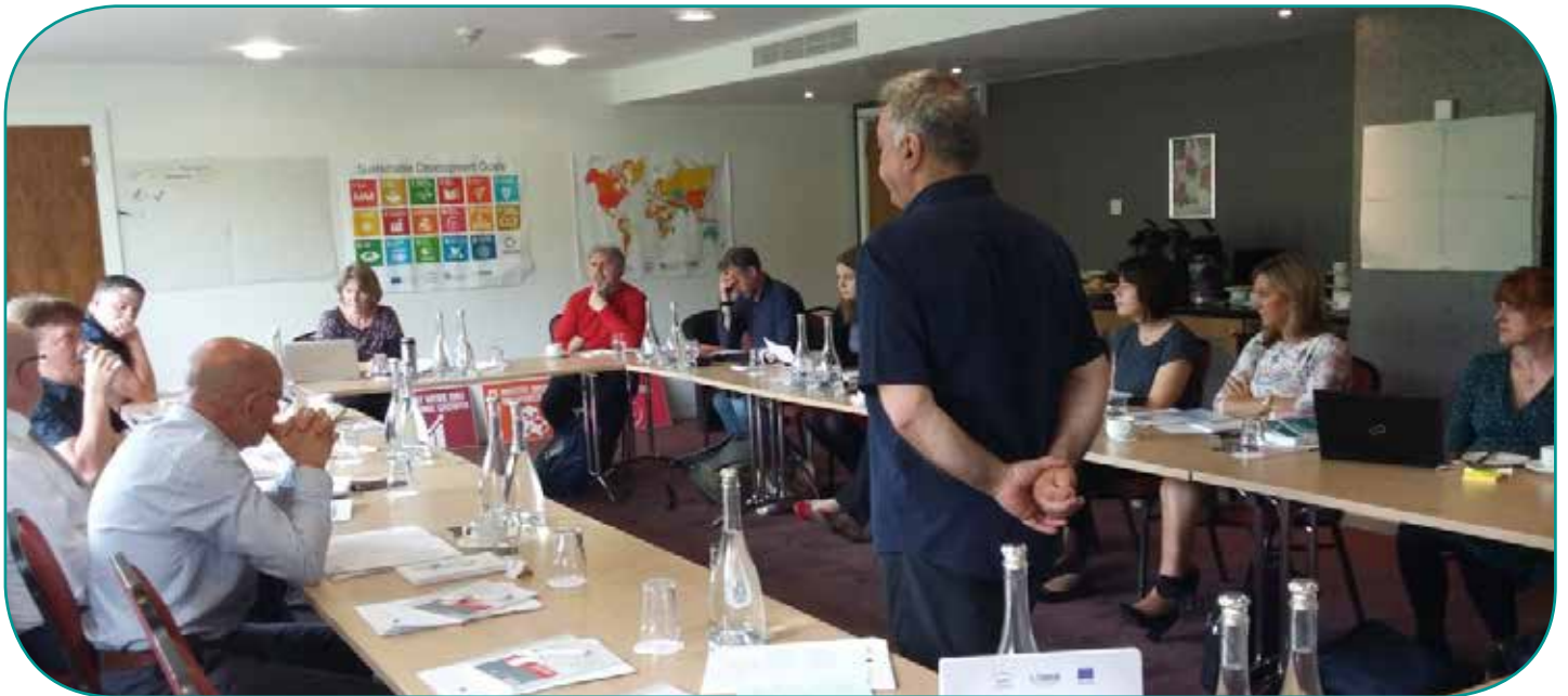
Participants at the National Training Sessions in Galway