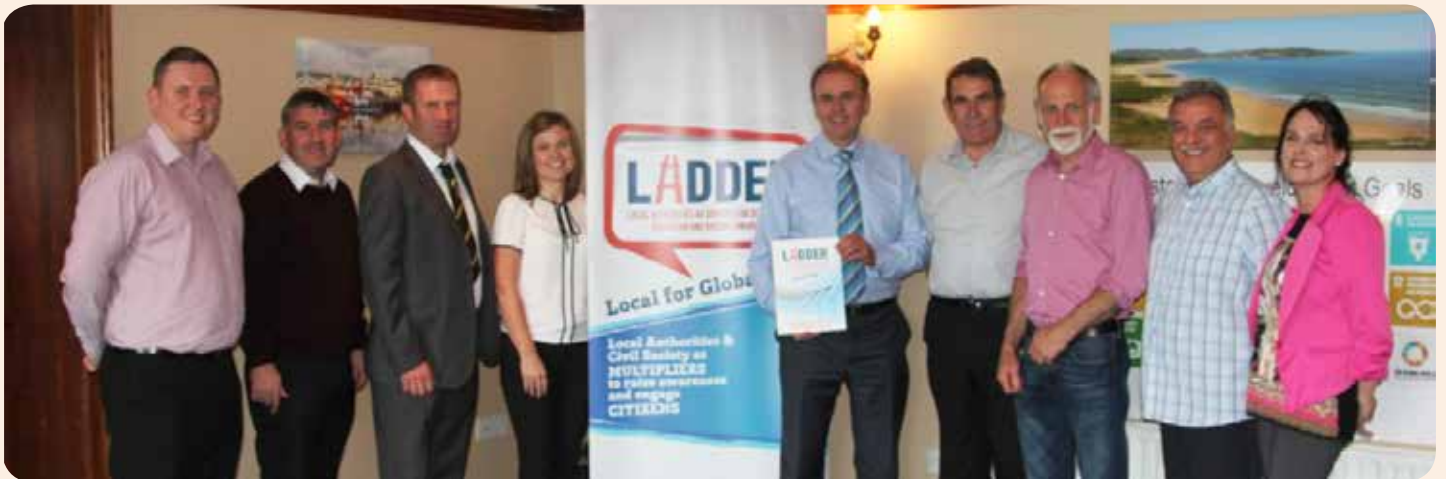
Minister for State at the Department of Foreign Affairs and Trade, Joe McHugh, T.D., with participants at the LADDER National Level Training session for Elected Representatives and members of the Strategic Policy Committee held recently in Donegal.